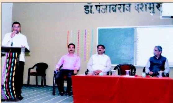
IQAC Workshop for Teachers & Students