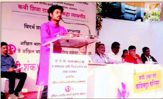
A Student presenting his poem in 92nd All India Marathi Literary Association, Yavatmal