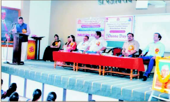
Ozone Day Celebration 22 Oct. 2018