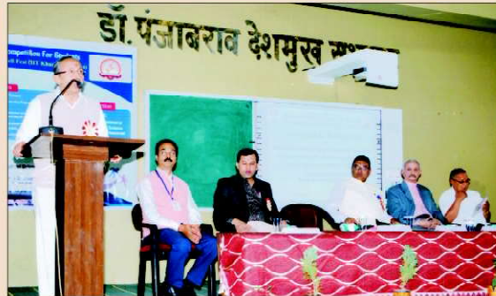
National Level Competition for Students in collaboration with IIT Kharagpur