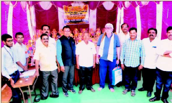
Eco-friendly Ganesha by the Dept. of Botany