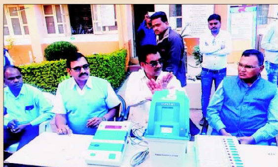
Voters Registration & Awareness Programme with VVPAT Machine