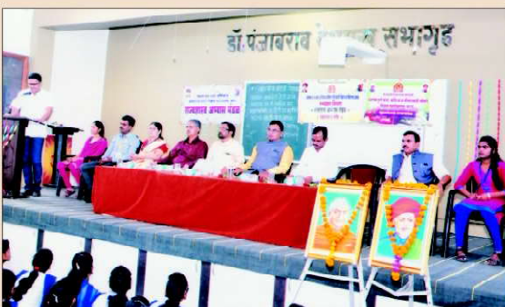
Inauguration of Philosophical Association for Students