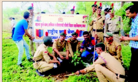
Tree Plantation by NCC Cadets