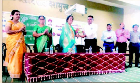
International Women's Day Celebration