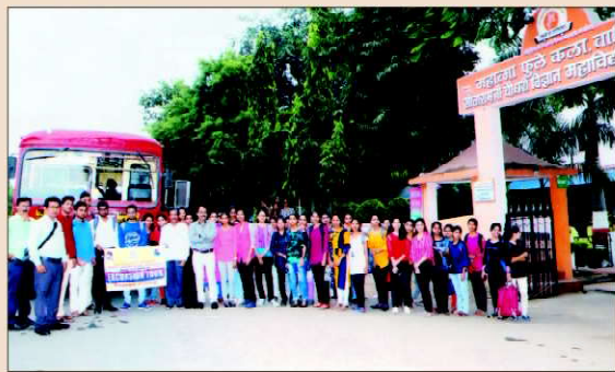
Zoological Excursion Tour to 'Mahan Dam', Dist. Akola