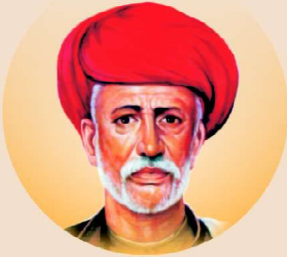
Mahatma Jyotiba Fule (1827-1890)