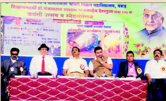
Alumni Association Meet during Annual Social Gathering