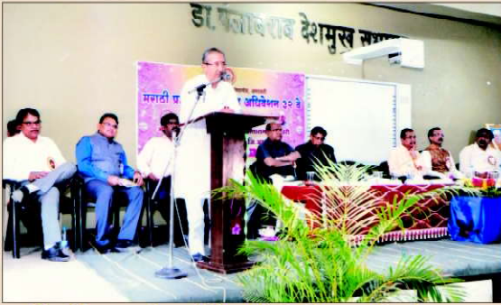
32nd Convention of Marathi Professors Conference