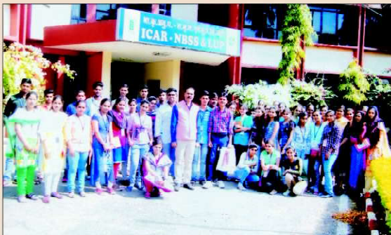
Botanical Excursion Tour at ICAR-NBSS & LUP