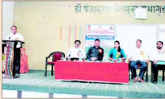
Workshop on Application of Android Mobile