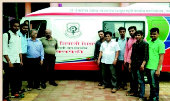
Blood Donation Camp organized by NSS unit of the college