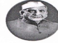
Founder President Dr. Panjabrao alias Bhausaheb Deshmukh M.A., D. Phil., LL.B., Bar-at-Law