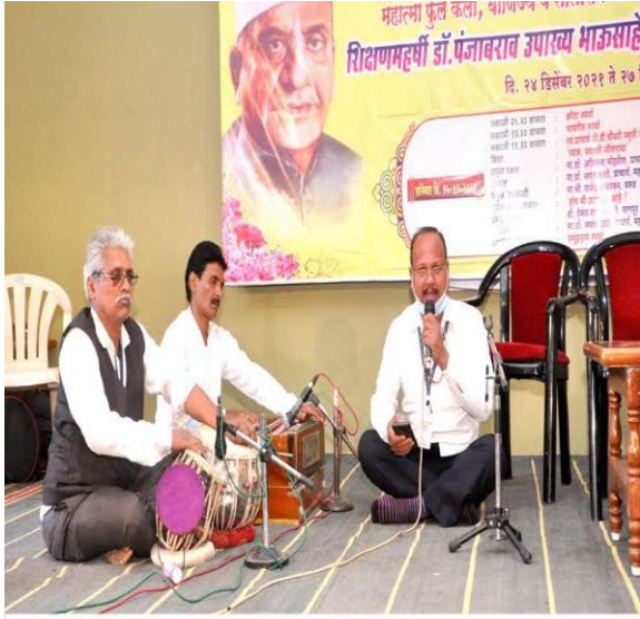
महात्मा फुले महा. वरुड...स्नेहसंमेलन....भावगीत स्पर्धा .....दि.२५.१२.२०२१